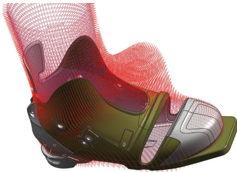
Heavy FEA use was instrumental in achieving performance goals on Black Diamond's freetouring ski boots.

more weight with the older design after we did the (FEA) analysis,” says Brendan Perkins, design engineer at Black Diamond. Starting with a clean slate, the engineering team gave the designers a basic mockup of what the ice tool's wall thickness should be along with other critical design elements like pick angle and approximate shaft size. Using the same iterative design workflows, the team came up with a new hydroformed aluminum shaft design that was 9.4 percent lighter.